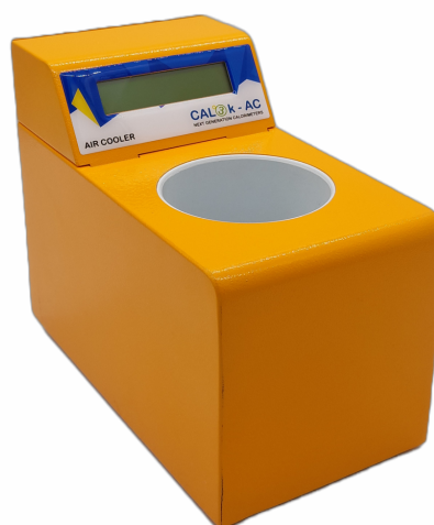
CAL4K-4 Oucik Thread Bomb Vessel & Air Cooler