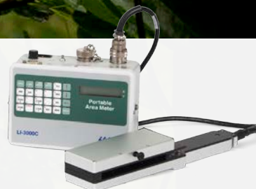
LI-3000C Portable Area Meter