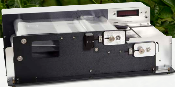
LI-3100C Leaf Area Meter