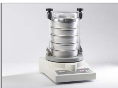
Grinding and sieving in one unit: the PULVERISETTE 0 as ANALYSETTE 3 SPARTAN