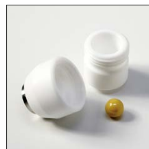
PTFE bowl for use in biotechnology

The ultra-compact FRITSCH Mini-Mill is the ideal assistant for fine comminution of smallest quantities – for wet grinding as well as for dry or cryogenic grinding. Its special, spherical grinding bowl ensures much better performance in grinding, mixing and homogenising compared with similar models. With a footprint of just 20 x 30 cm and a weight of 7 kg, it easily fits anywhere. It's smart, is extremely user-friendly, inexpensive, and convinces with impressive results: small, fast, effective.