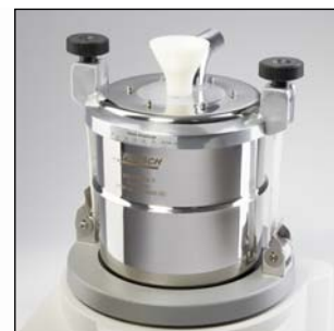
FRITSCH cryo-box for fast, simple embrittlement

The FRITSCH PULVERISETTE 0 is the ideal laboratory mill for fine comminution of medium-hard, brittle, moist or temperature-sensitive samples – dry or in suspension – as well as for homogenising of emulsions and pastes.