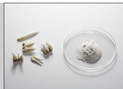
Teeth before and after grinding with the FRITSCH PULVERISETTE 0