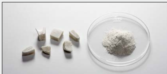
Bone material before and after grinding with the FRITSCH PULVERISETTE 0

For comminution of bones, e.g. for XRF analysis for medication development, we recommend the Vibratory Micro Mill PULVERISETTE 0 with mortar and grinding ball made of zirconium oxide or steel. The special advantage: Gentle sample preparation without development of heat or thermal loads.